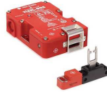
SAFETY SWITCHES PLE GL