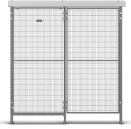
SINGLE SLIDING DOOR