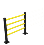
DELTA 4 BEAM