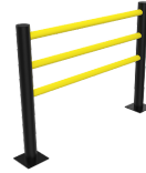
DELTA 3 BEAM