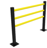
DELTA 3 BEAM