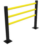
DELTA 3 BEAM