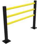
DELTA 3 BEAM