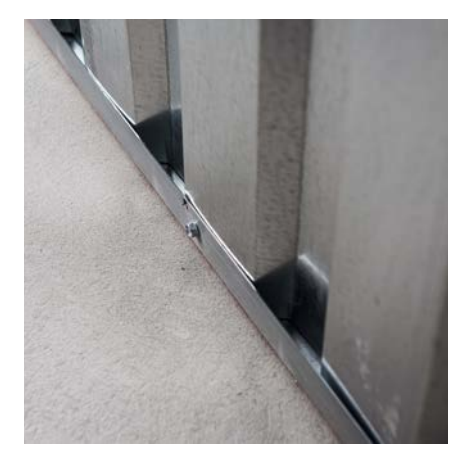
WALL PANELS The wall system provides an economical and attractive divider, which also makes the storages safe.