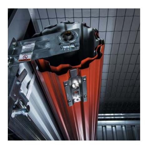
ROLL-UP DOOR The best choice for an easy operable and low maintenance roll-up door.

WE SELL SELF STORAGE SOLUTIONS BOTH WITH AND WITHOUT ASSEMBLY. AT SELF-ASSEMBLY, WE PROVIDE EASY FOLLOW ME INSTRUCTIONS FOR YOUR LOCAL ASSEMBLY TEAM.