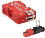
SAFETY SWITCHES PLE GL